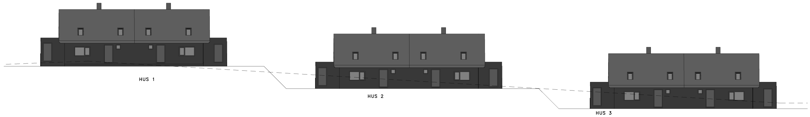
FASADE VEST HUS 1-3