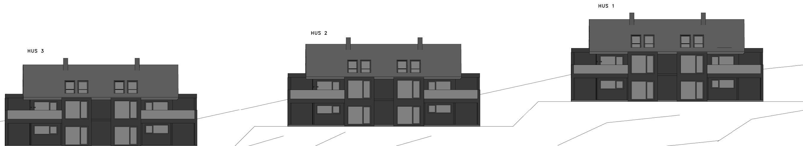
FASADE ØST HUS 1-3